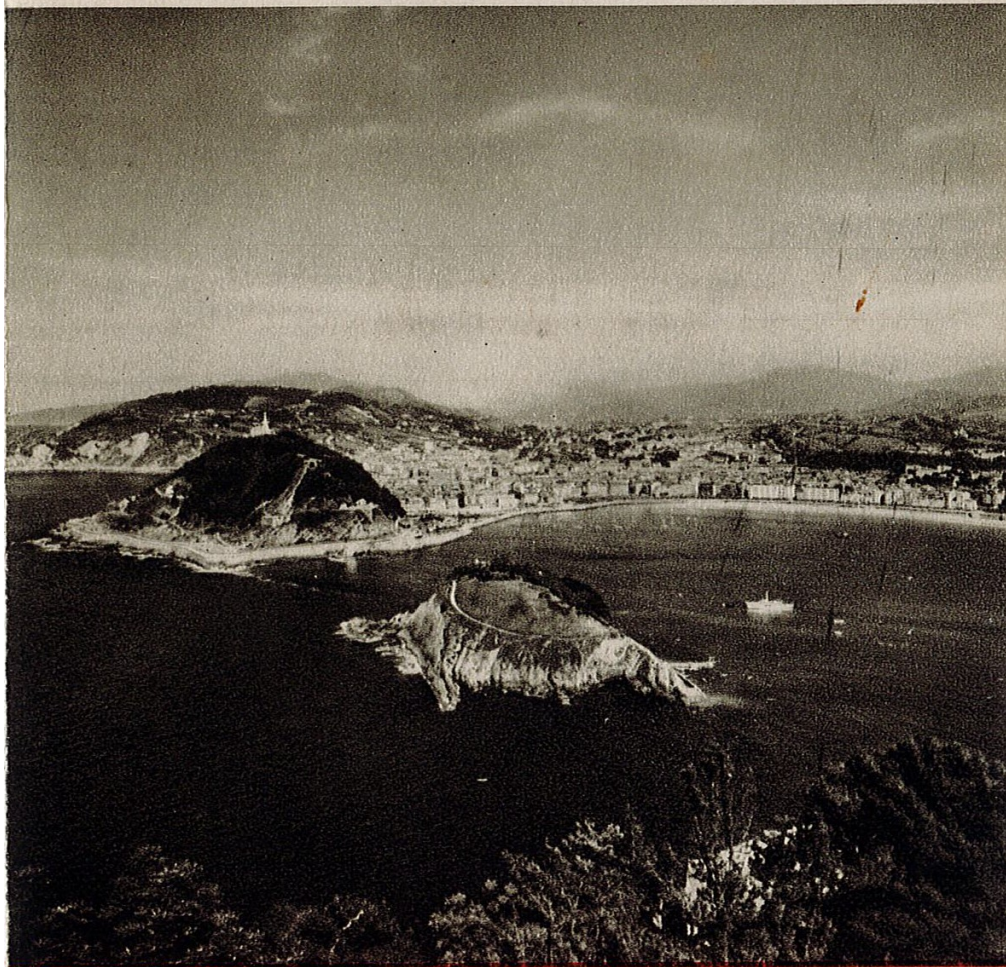
ABOVE. Promenade. BELOW. View from Monte Igueldo.