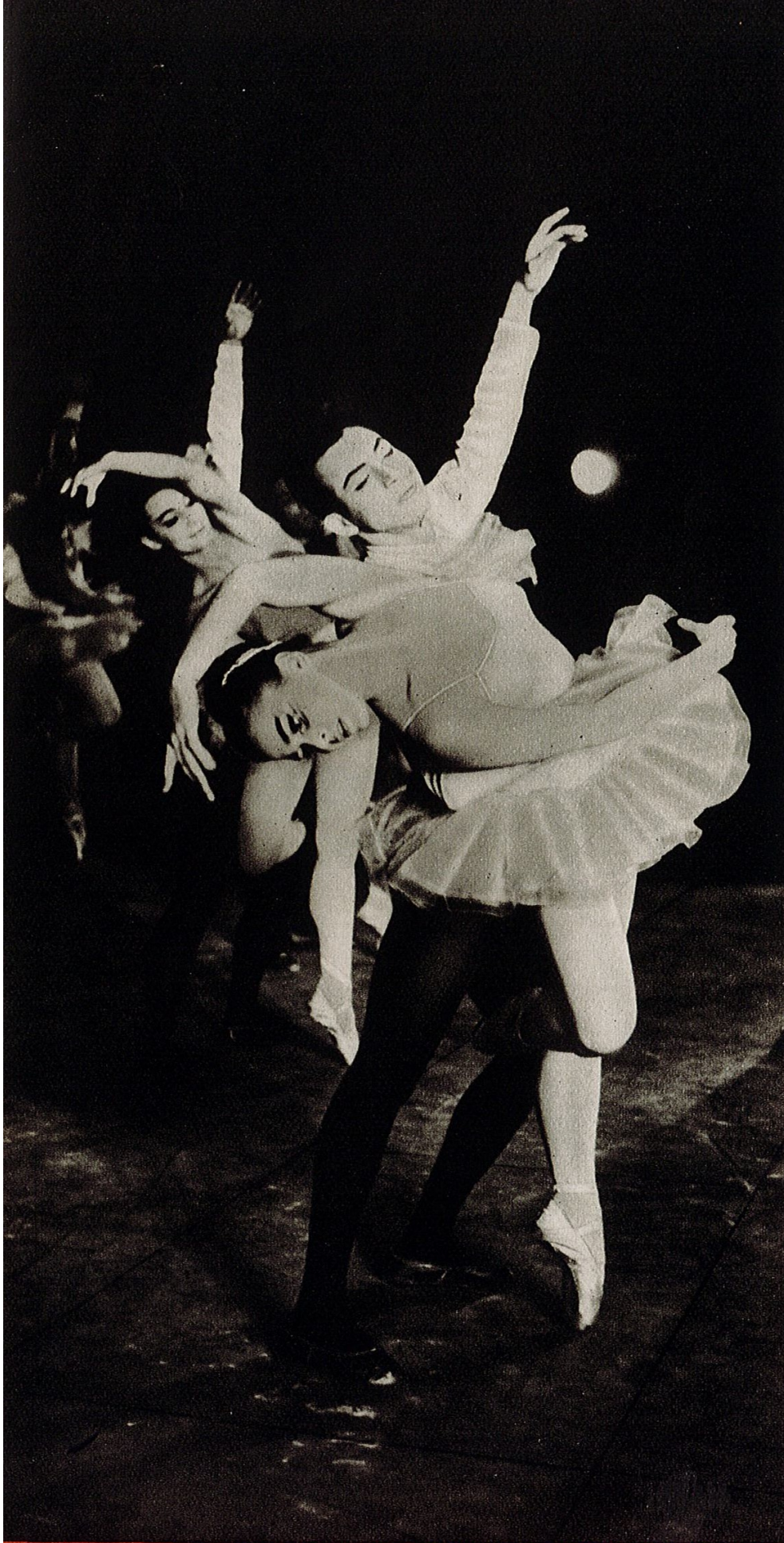
Summer Festival, Ballet.

TOURIST INFORMATION OFFICE IN SAN SEBASTIAN: Idlázquez, 8 Tel. 11774 Office hours: 9,30 - 1,30 and 3,30 - 7