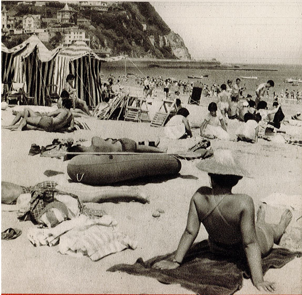
ABOVE. Lasarte Race-course. BELOW. Ondarreta Beach.